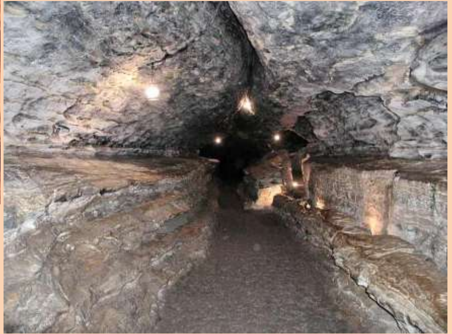
One of countless connecting passages in Mark Twain Cave, Hannibal ▲ ◀ Massive cave formation in Meramec Caverns, Stanton