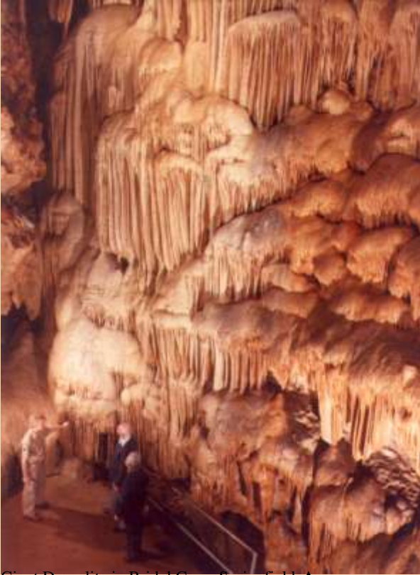
Giant Drapolite in Bridal Cave, Springfield ▲