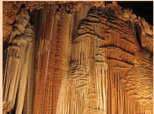
Photo of Meramec flowstone

Also in the Area: Meramec State Park also includes lantern tours of the less developed Fisher Cave. Just down the road from Meramec Caverns and State Park are the Onondaga Cave and State Park and the Cathedral Cave in Leasburg. Both state parks also offer canoeing, rafting, fishing, hiking, and camping, making the Meramec River area a prime vacation spot for families.