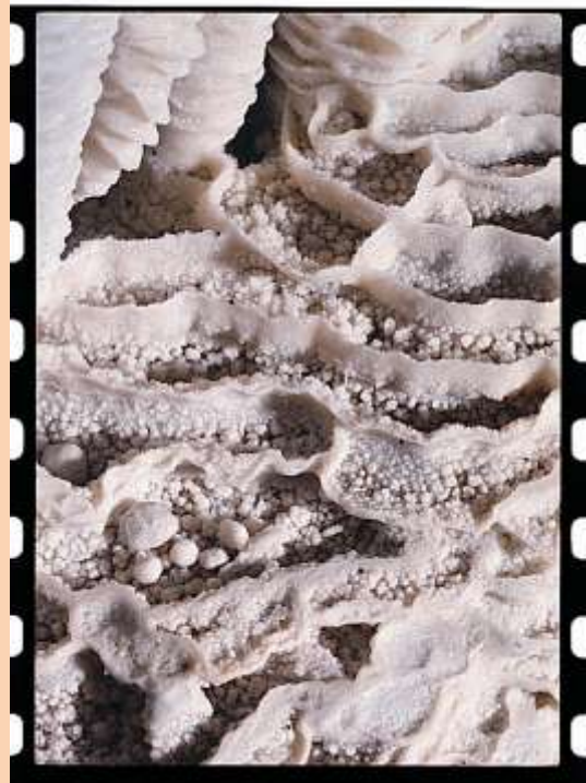
Above: Rimstone cradles a collection of cave pearls.

Also in the Area: Bridal Cave is also in the Springfield area for visitors who can't get enough cave viewing. Bass Pro Shops Outdoor World attracts its own share of Springfield visitors. Branson and Silver Dollar City are less than an hour away for those who are ready to spend some time in the sun.